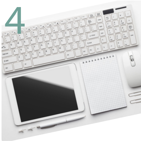
4 Tablets, Keyboards, Mouse & Misc. Writing/Office Tools