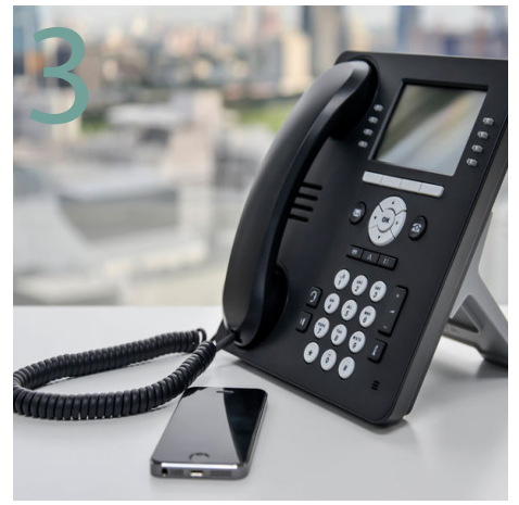
3 Desk Phones & Mobile Phones