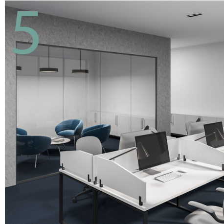
5 Cubicles, Desks & Conference Area Tables