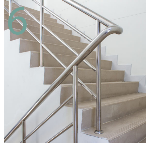
6 Stair Hand Rails