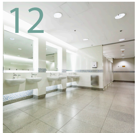
12 Restroom: Entry Doors, Partition Doors, Faucets, Dispensers, Toilets, Urinals & Flush Handles*