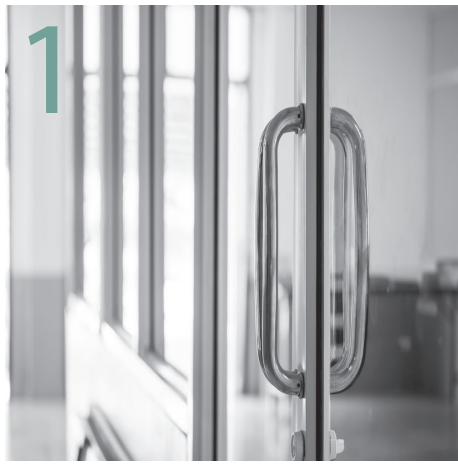
1 Door Handles & Pushplates