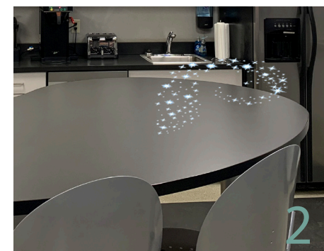
2. Surfaces should be clean and free of all visible soil prior to disinfecting.