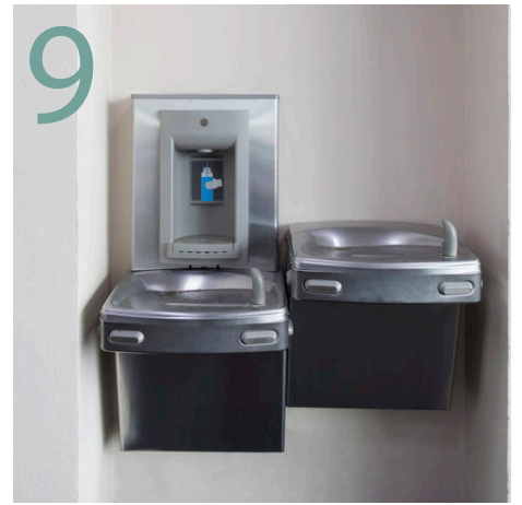
9 Drinking Fountains