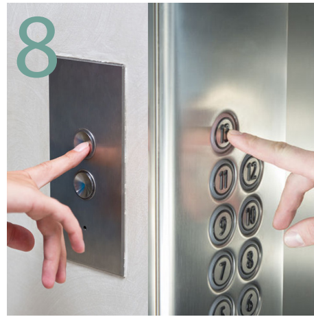
8 Elevator Buttons, Inside and Out... Any Touch Light Switches Too.