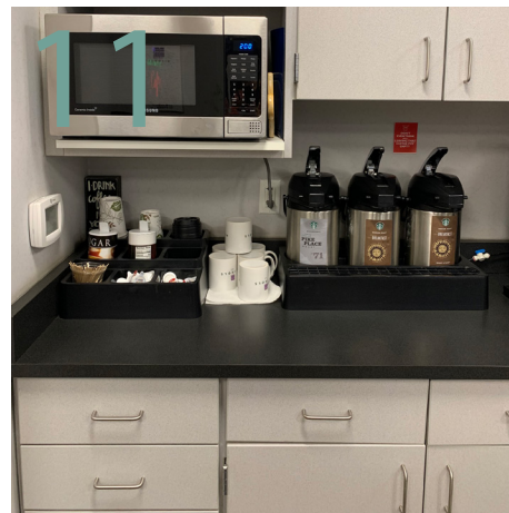
11 Breakroom: Coffee Pots, Condiments, Counters, Tables, Chairs, Cupboard, Refrigerator & Microwave Handles