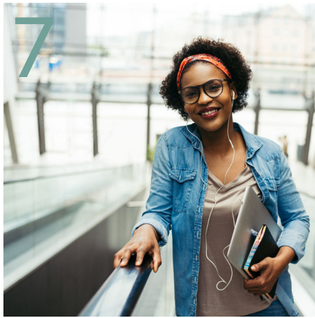
7 Hand Rails on Escalators