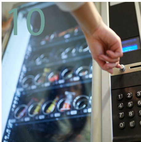
10 Vending Machines