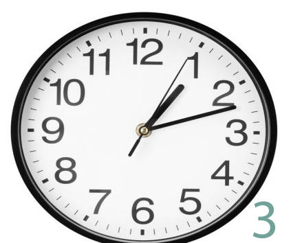
3. Be sure the surface remains visibly wet for the dwell time noted on the product label.

*See Nichols Restroom Chart for Routine Cleaning Details